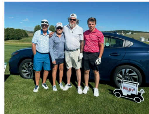
Members of the Fitzgerald Family Foundation provided us with two teams and a top sponsorship for the outing.

Safe Haven is thankful for the many companies and individuals who have supported our golf outing as well as other events and general operations. With your continued support, we can continue to make a meaningful impact in the lives of animals and those who love them.