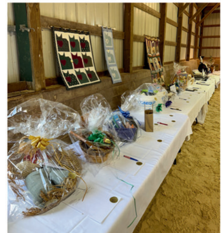
Guests had a variety of silent auction items to choose from.