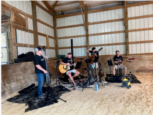
The DR Duo band was amazing! Plans are in the works for them to join us next year.

General planning for the 2025 gala is already underway. Watch for our Spring newsletter in the April/May timeframe for details. Again, thank you to all who contributed to making this event such a success.