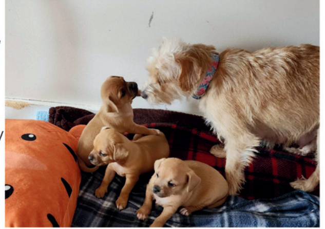
Melah and her 3 pups, Bingo, Indy, and Rusty.